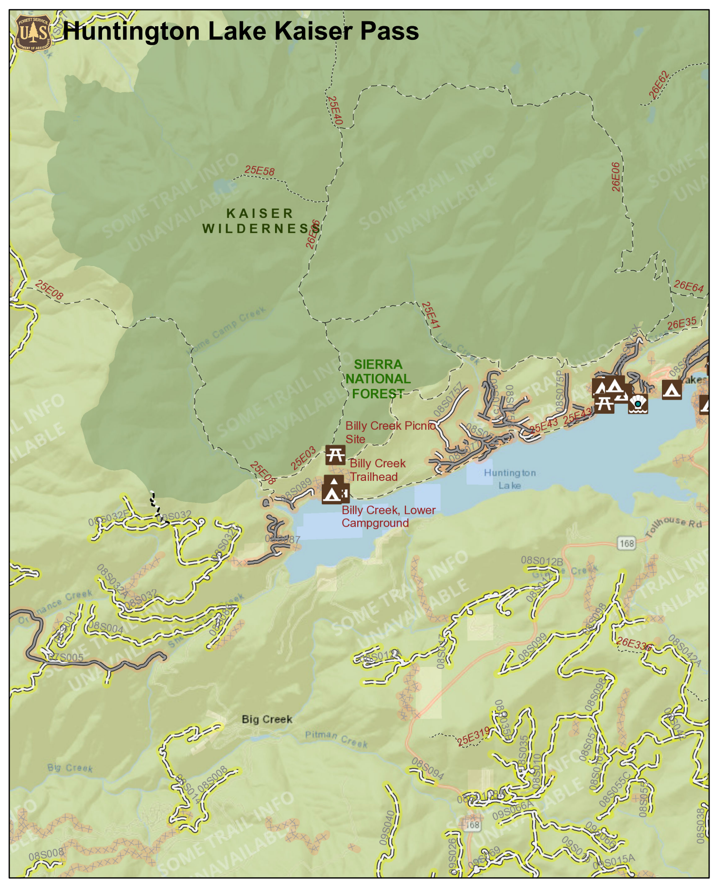
Refer to the official motor vehicle use map (MVUM) before making travel plans. Other important information about this map is located on page two of this document.